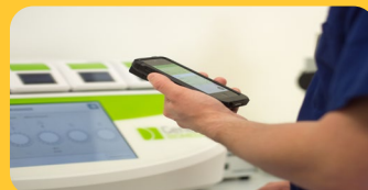
Real-Time Testing and Sensors