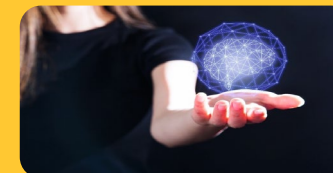
Digital Innovation in Biopharma R&D