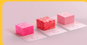
Cell Culture Media Recycling for Cultured Meat