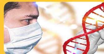
Nanoparticle for Nucleic Acid Delivery